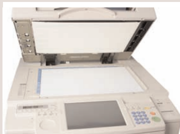
A digital copier or an MFP (multi-function peripheral) device can often serve as a document scanning on-ramp for your ECM system.

An ECM software platform will be of limited value without the document scanning devices that allow you to convert paper documentation into electronic images that can be managed by the system. Like ECM software, business-grade document scanning devices have become much more affordable to SMBs over the past few years. It used to be that a single business-grade document scanner required a five-figure investment. Today, several feature-rich desktop scanning devices are available in the $500-$2,000 range. However, depending on your needs, your ECM system may require multiple scanning devices with various volume capacities. These hardware demands can drive up the cost of the overall solution.