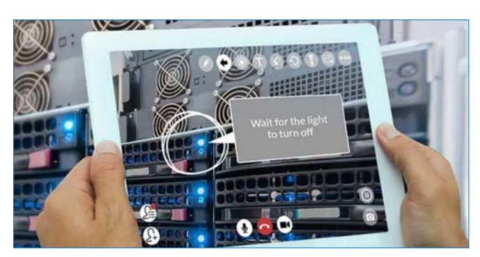
Xerox's CareAR Service Experience Management platform