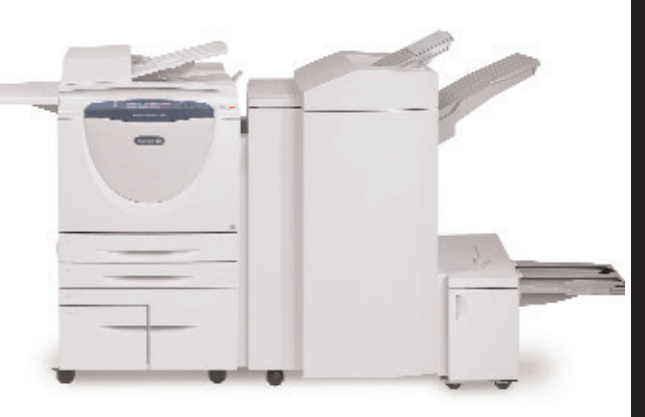
Xerox WorkCentre 5790 – Strong paper-handling options includes three finishers and a postprocess inserter.

First, there is the so-called "office finisher" ($2,500) offered on all models except for the 5790. It has 250-sheet and 2,000-sheet trays and 50-sheet multiposition stapling. There is an optional 2/3-hole punch for this unit ($795).