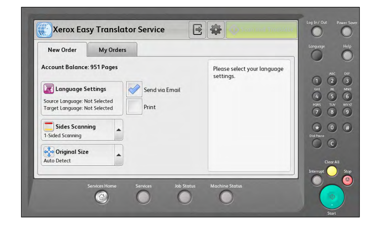
Xerox Easy Translator Service MFP user interface